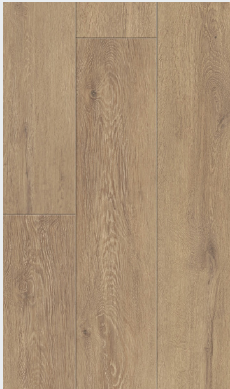
SANDY OAK 7012