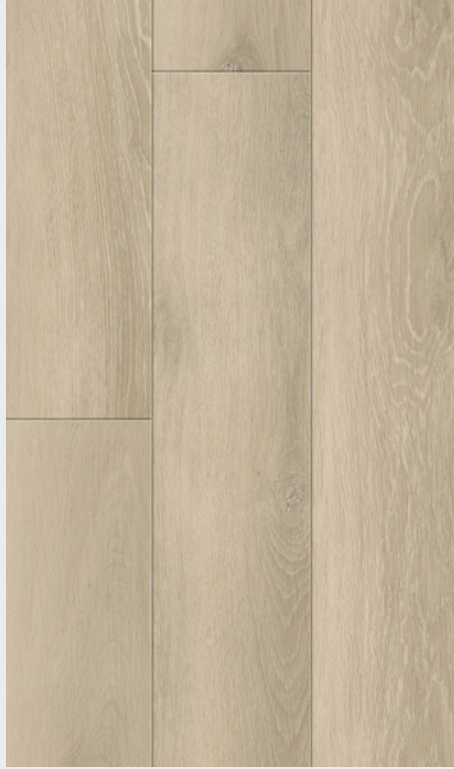
DEL MAR 7013