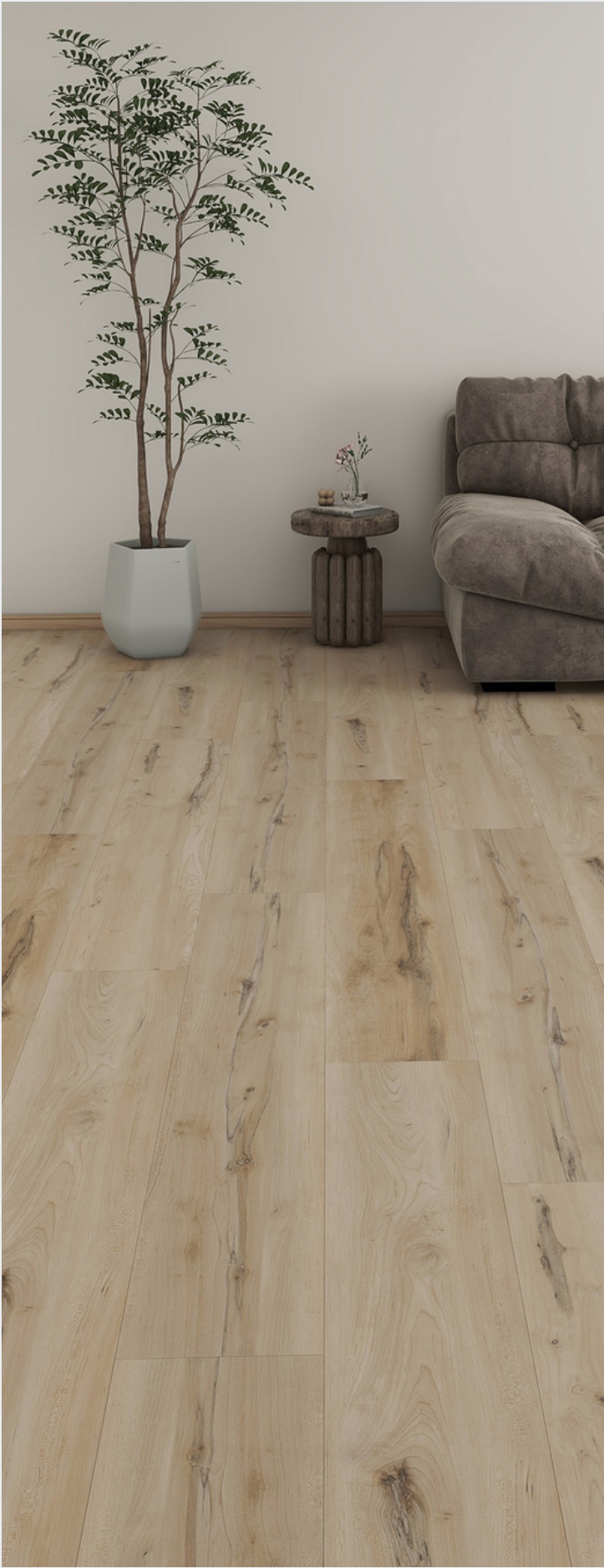
JetCore Wildwood Sands (7023)