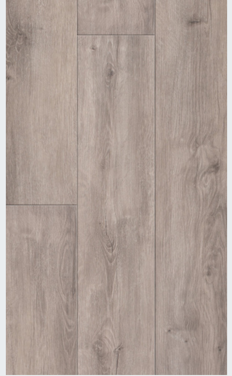
WINTER GREY 7011