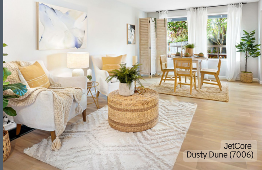
JetCore Dusty Dune (7006)