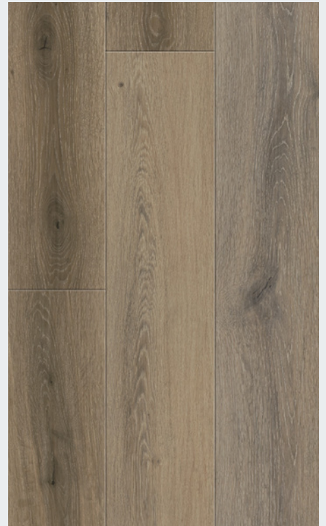
RUSTIC GROVE 7018