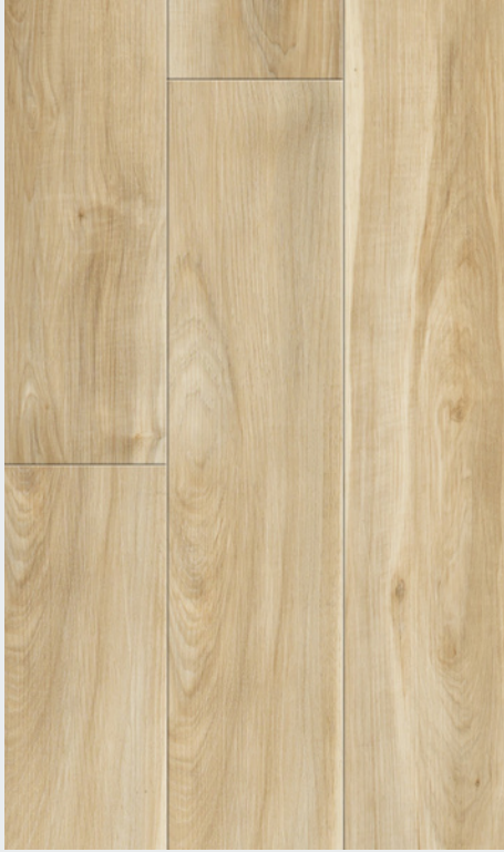
DUSTY DUNE 7006